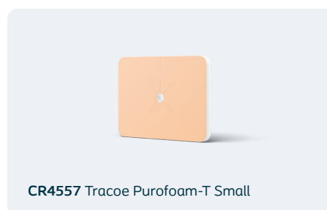
CR4557 Tracoe Purofoam-T Small