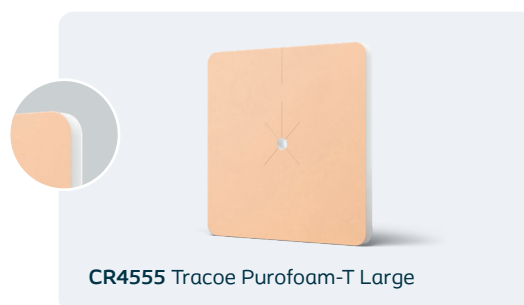
CR4555 Tracoe Purofoam-T Large